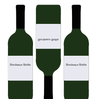
Capacity based on Bordeaux Bottles