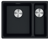
MRG160-34/15 SBR ON