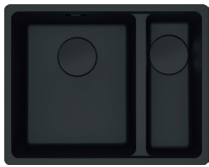
MRG160-3 4/15 SBR MB