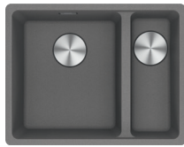
MRG160-34/15 SBR SG