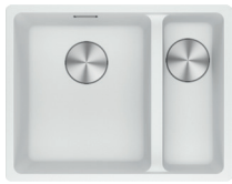
MRG160-34/15 SBR PW