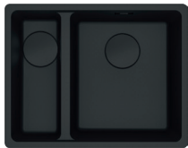
MRG660-34/15 SBL MB