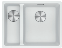
MRG660-34/15 SBL PW